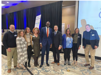
Alliance partners joined Lt. Governor Garlin Gilchrist following his keynote address.