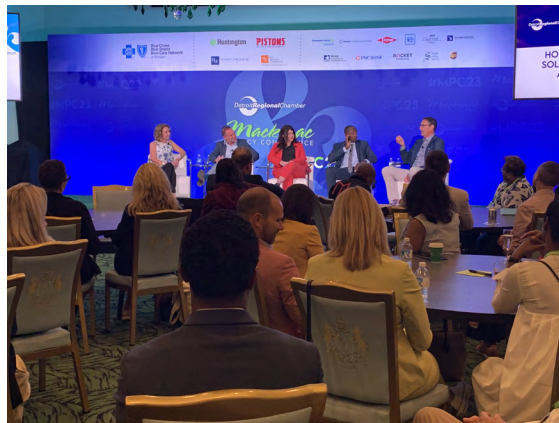
Mackinac Policy Conference Housing Panel

The summit featured several updates and presentations highlighting solutions and tools for housing being used in the region.